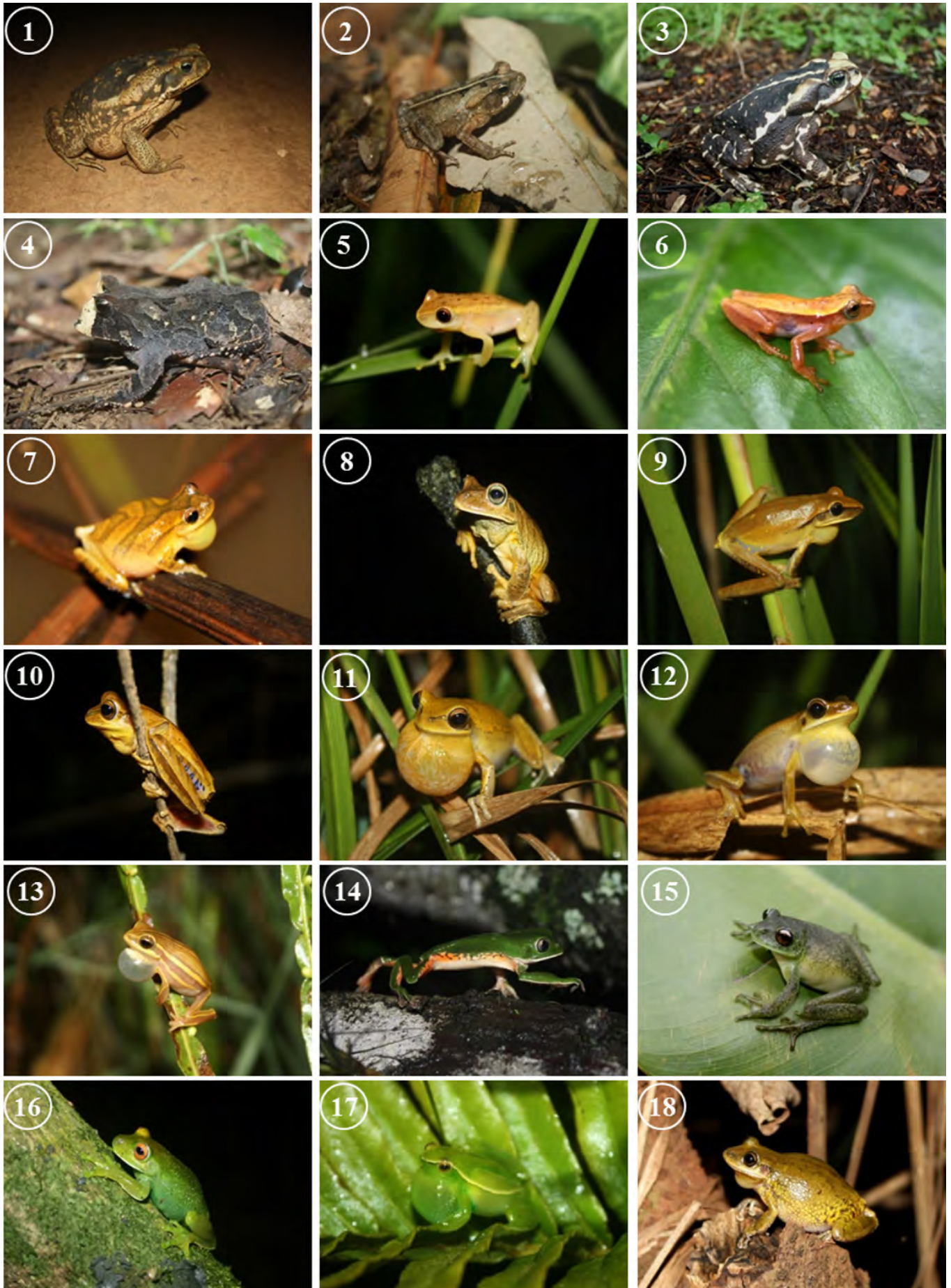
FIGURE 2. Species recorded in the study area: 1- Rhinella schneideri , 2- R. abei , 3- R. ictérica , 4- Proceratophrys boiei , 5- Dendropsophus nanus , 6- D. sanborni , 7- D. minutus , 8- Hypsiboas faber , 9- H. albopunctatus , 10- H. bischoffi , 11- H. prasinus , 12- H. caingua , 13- H. jaguariaivensis , 14- Phyllomedusa tetraploidea , 15- Aplastodiscus perviridis , 16- A. albosignatus , 17- Sphaenorhynchus surdus , 18- Scinax fuscovarius .